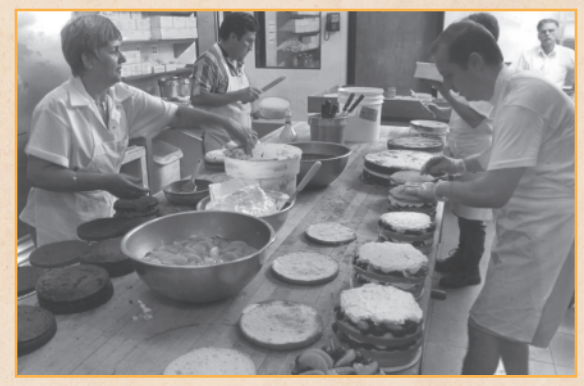
For generations, Mozzicato DePasquale Bakery and Pastry Shop has been producing the finest Italian pastries, cakes, cookies and breads.

ITALIAN ICE - Almond, Chocolate, Lemon & Strawberry